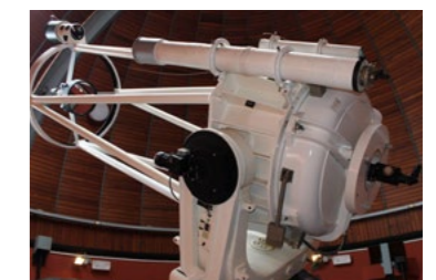
Brera Astronomic Observatory - INAF