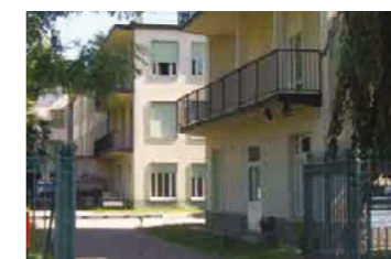
INRCA Research Hospital National Institute for the Rest and Care of the Elderly