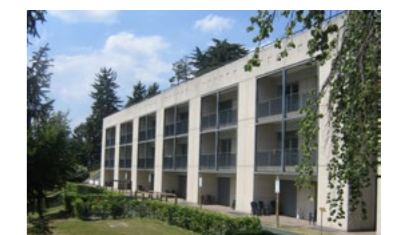
Valduce Hospital - Villa Beretta Rehabilitation center