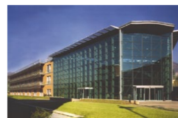
E. Medea Research Hospital La Nostra Famiglia Association